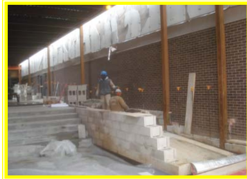
Concrete slabs poured and preparation in Performing Arts addition