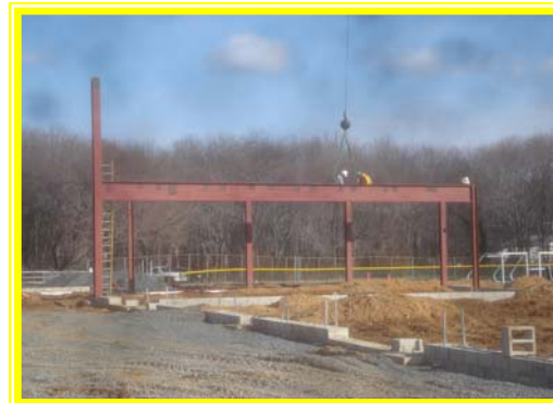
Start of steel erection at Physical Education addition