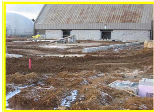
Water logged conditions in Gym Addition area on 12/4/07