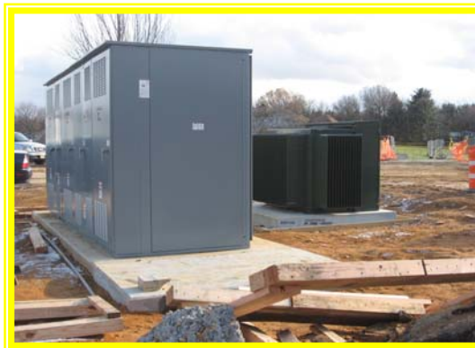
New electrical gear and PSE&G pad mount transformer for new electrical service