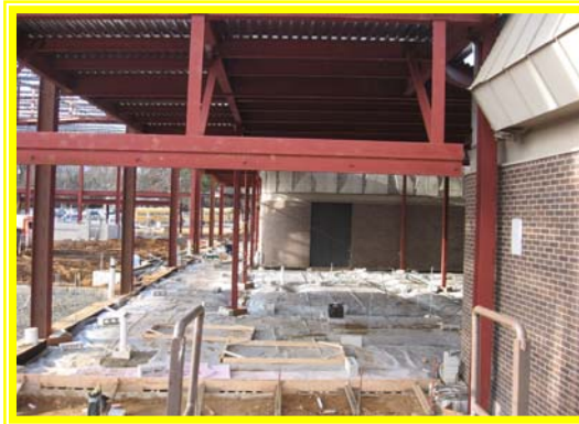
Steel deck and slabs awaitng pour at Performing Arts Addition