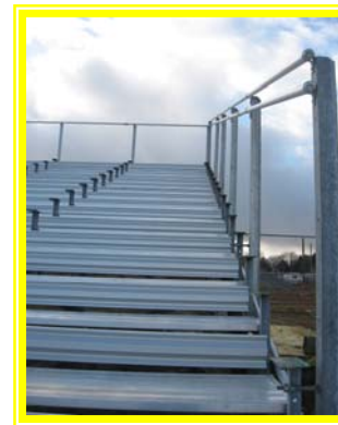
High School South home side bleacher refurbishing in progress