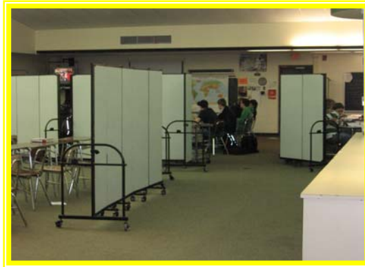
Completed movable partition installation