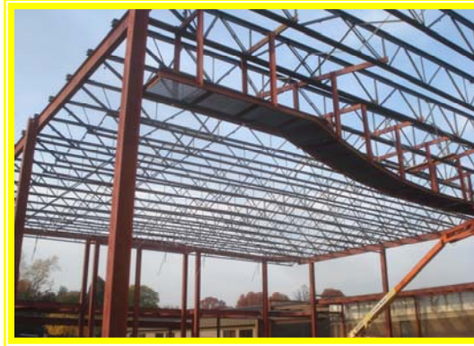
Long span joists and catwalk in auditorium